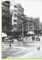
Copyright © 2008 Sacramento County Office of Education Some images used under license from Shutterstock, Inc.