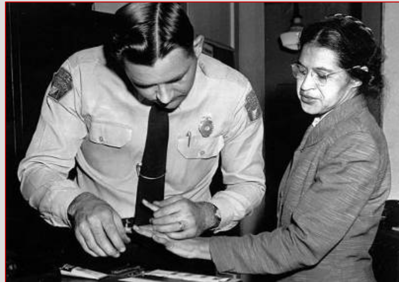
Rosa Parks being fingerprinted after her arrest.