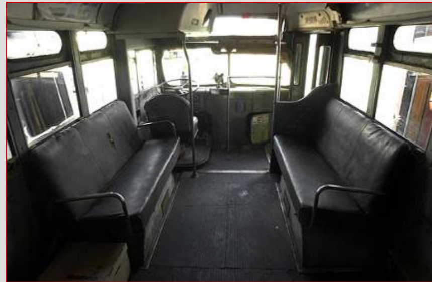
Inside the bus where Rosa Parks sat.