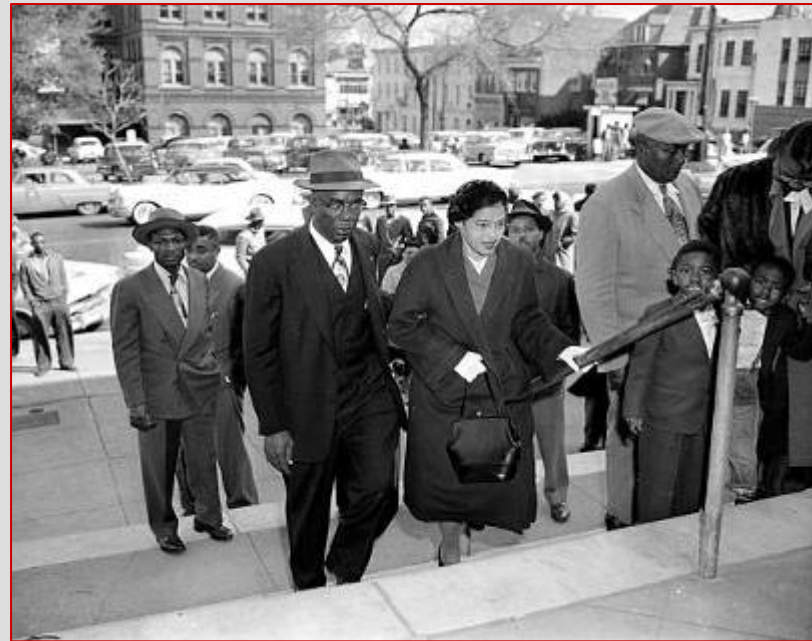
Rosa Parks going to her trial.