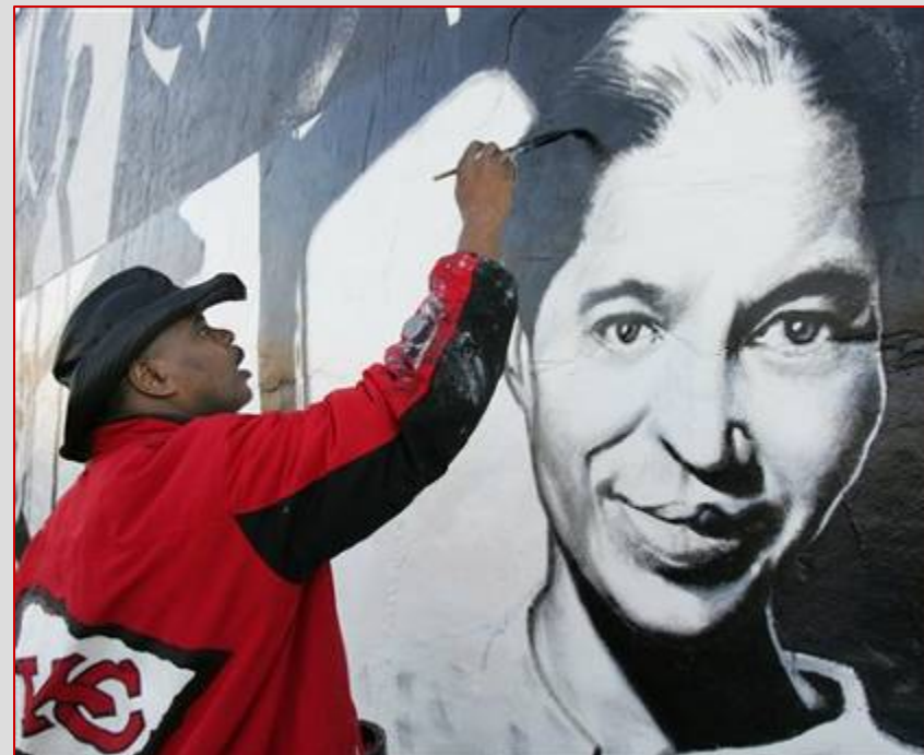
A mural being painted of Rosa Parks